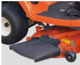
Gate open with discharge chute

In this mode, the deck discharges grass evenly and efficiently through the side of the deck, utilizing two counter-rotating blades. The flow created by these blades is where the Infinity Deck gets its name.