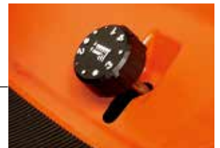
Easy Reach Cutting Height Adjustment Dial