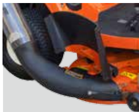
Gate open with grass catcher attached

Using the optional grass collector is now easier than ever. Its innovative design makes attaching the grass collector boot simple as well; no tools required. Just use your hands to attach and detach for your occasional collecting needs.